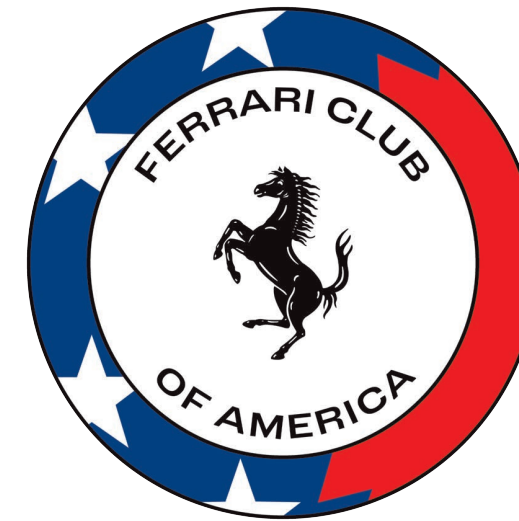
Empire State Region

Left is a small example of the other Ferrari club logos in use within your global family.