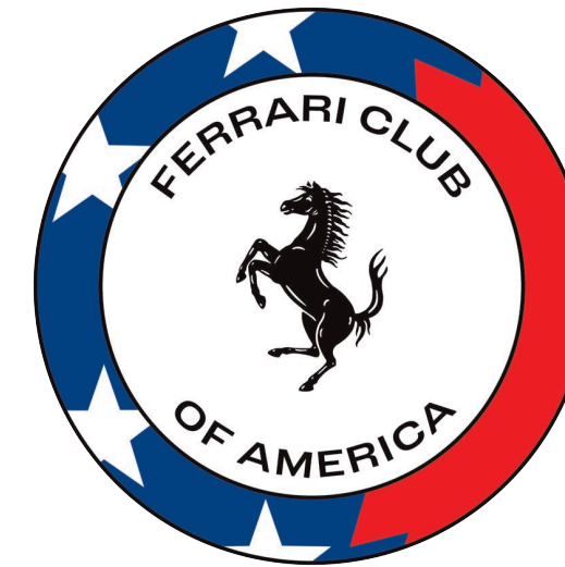
Greater Orlando Chapter